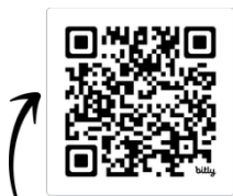
Herb Garden Sign Up

On Sunday, April 26th , we will be offering a Make Your Own Herb Garden for all who are interested. Join the Parish Life Team this spring in creating potted Italian herb gardens! Pots, soil, plants and decorative pot coverings will be provided. This event is appropriate for all ages. Make one for yourself, a friend, a mom for Mother's Day, or even a dad. If you prefer to bring your own pot, select one that is 3-4