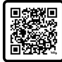
Nametags Order Form

Jen will be placing an order for nametags the week of May 18 th . If you would like to order one for yourself or your family, please go to https://bit.ly/42r9tWA or scan the QR code.