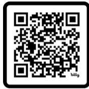
Nametag Order Form

Jen will be placing one more order for nametags at the end of June . If you would like to order for yourself or your family, please go to https://bit.ly/42r9tWA or scan the QR code.